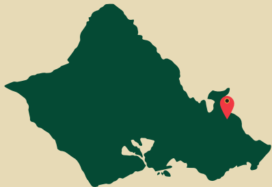
Kailua, on the island of O'ahu

Hawai'i is the most racially diverse state in the nation with almost one in four people identifying as mixed race. It is also the only state that has never had a white majority. The largest percentage of the population is Asian, while Native Hawaiians and Pacific Islanders also make up a significant part. This blending of eastern and western cultures helps produce understanding and acceptance for those of diverse cultural backgrounds. The aloha spirit is a living reality for native Hawaiians and non-Hawaiians alike, who actively seek to make those around them feel loved and welcomed.